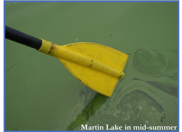
Martin Lake in mid-summer

Four locations for carp barriers were identified. These include the Typo Lake outlet, north inlet of Martin Lake, south inlet of Martin Lake, and Martin Lake outlet. Funding for this project was provided by the Sunrise River Watershed Management Organization (WMO), Martin Lakers Association, and Conservation Partners Legacy (CPL) grant. The project has been organized through in-kind efforts of the Anoka Conservation District (ACD).