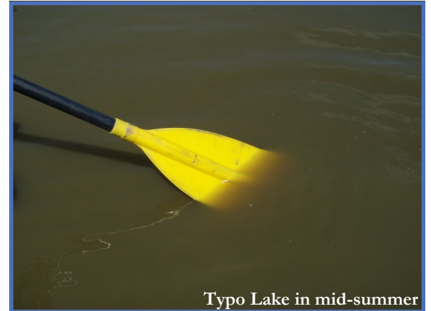
Typo Lake in mid-summer