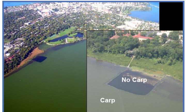
Carp exclusion curtain on Lake Wingra, WI shows potential water quality improvement when carp are controlled.

Carp are not the only cause of poor water quality, but are a significant contributor.