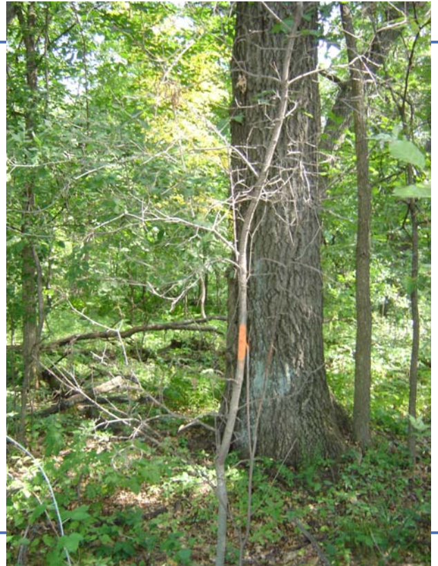
Buckthorn leaves out early and retain leaves late into the fall creating dense shade that helps it to out-compete many native plants. Buckthorn lacks natural controls in Minnesota.